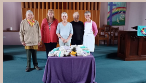
Some dishcloth knitters at Earlsdon with 140 dishcloths!!