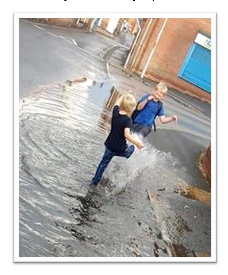
Splashing in the rain

Have you heard the saying, "Life isn't about waiting for the storm to pass, it's about learning to dance and splash in the rain"? We can choose to rejoice, and when we know God as Father and Jesus as Friend, we can have the Joy of the Holy Spirit as our strength.