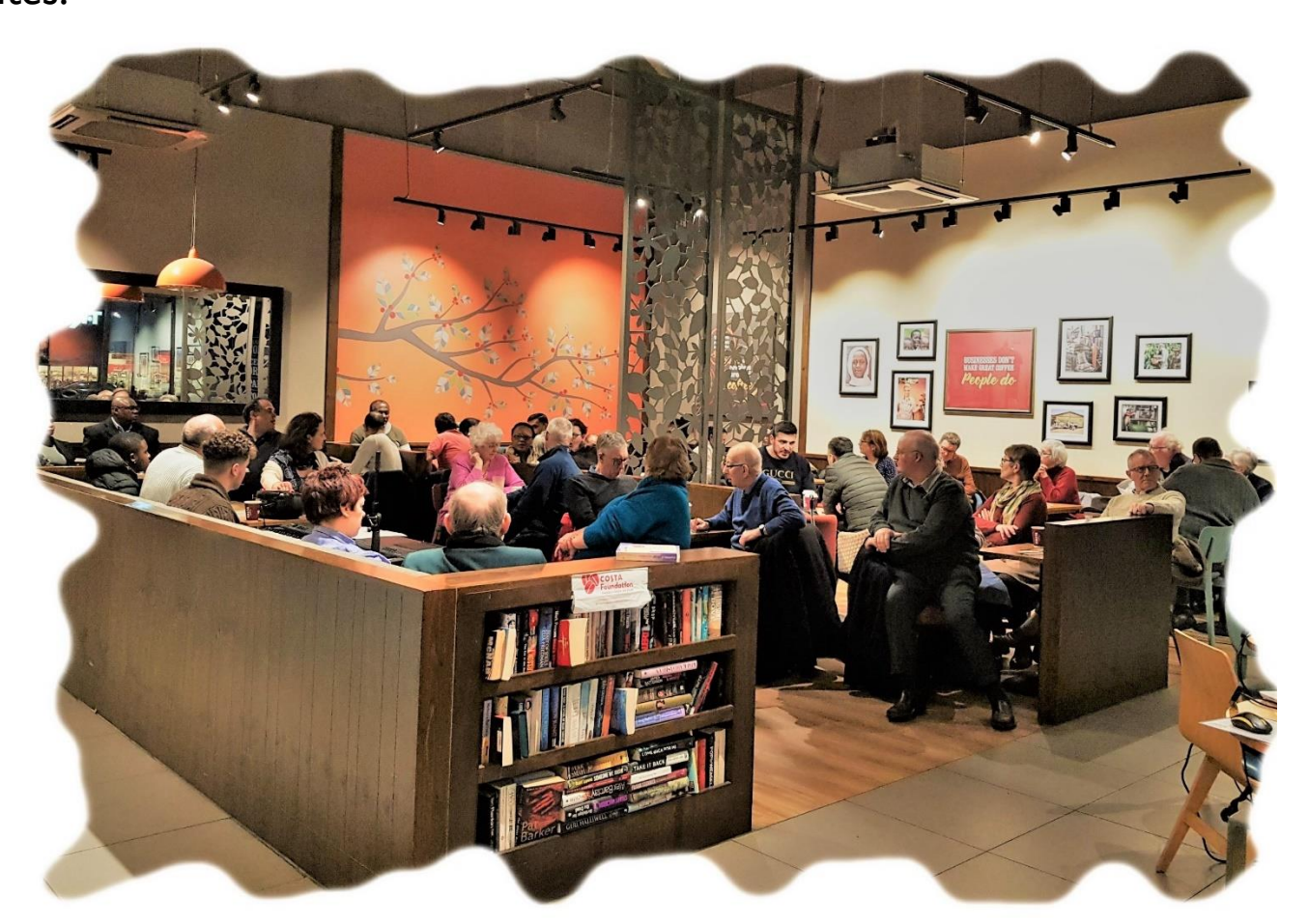
One of our Coffee Shop Sunday gatherings in January 2020

Other images are from Parish Pump (subscription paid) or royalty-free sites.